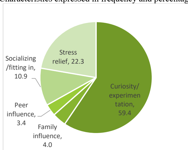
Figure 1: Bar graph showing the main reasons for initiating tobacco use among university students in Karachi.